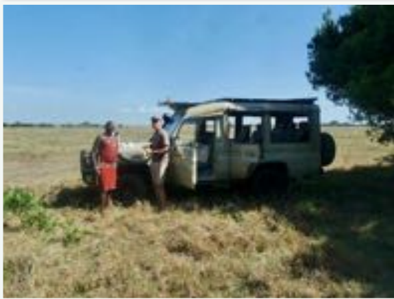
(the Africa Cycling 4x4 safari-car)

Getting out of bed early that day. An absolute highlight of your trip. When the sun rises you drive into the Mara, you see the hot air balloons take off and you go in search of the hunting lions, leopards and cheetahs and all the other beauty that the Mara has to offer. You can choose, a full-day safari with lunch on the savannas or a morning and afternoon safari, with lunch at the lodge in Talek.