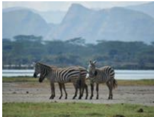
Lake Elementaita, Soysambu