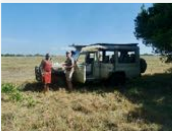
(the Africa Cycling 4x4 safari-car)

Out of bed early that day. An absolute highlight of your trip. As the sun rises you will drive into the Mara, watch the hot air balloons take off (which you might use to fly over the Mara yourself tomorrow?) and go in search of hunting lions, leopards and cheetahs and all the other beauty the Mara has to offer. You can choose, a full-day safari with lunch on the savannas or a morning and afternoon safari, with lunch at the lodge in Talek.